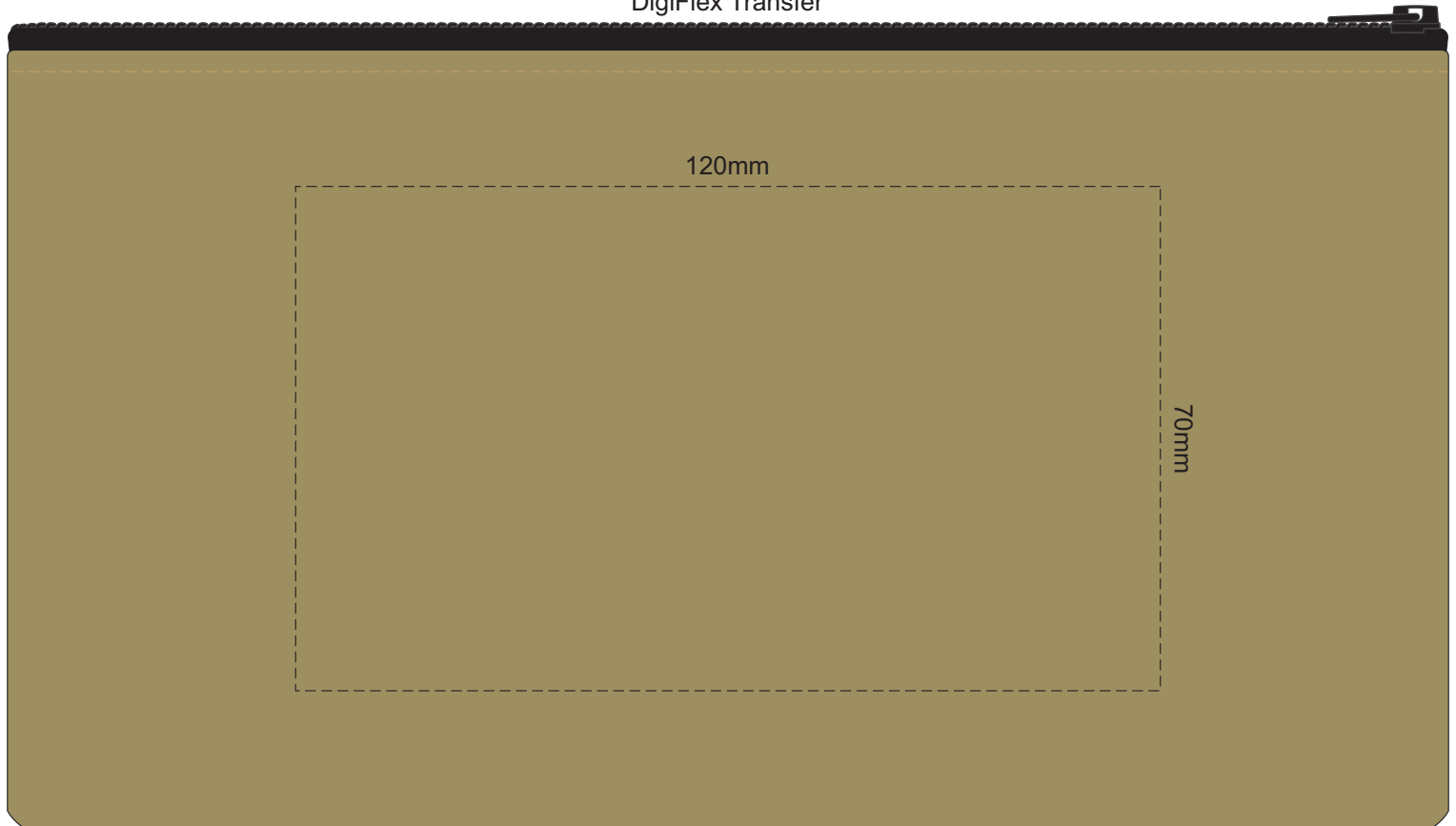
BACK (Closed zipper)

100% of Actual Size Screen Print (one colour) Colourflex Transfer Faux Embroidery DigiFlex Transfer