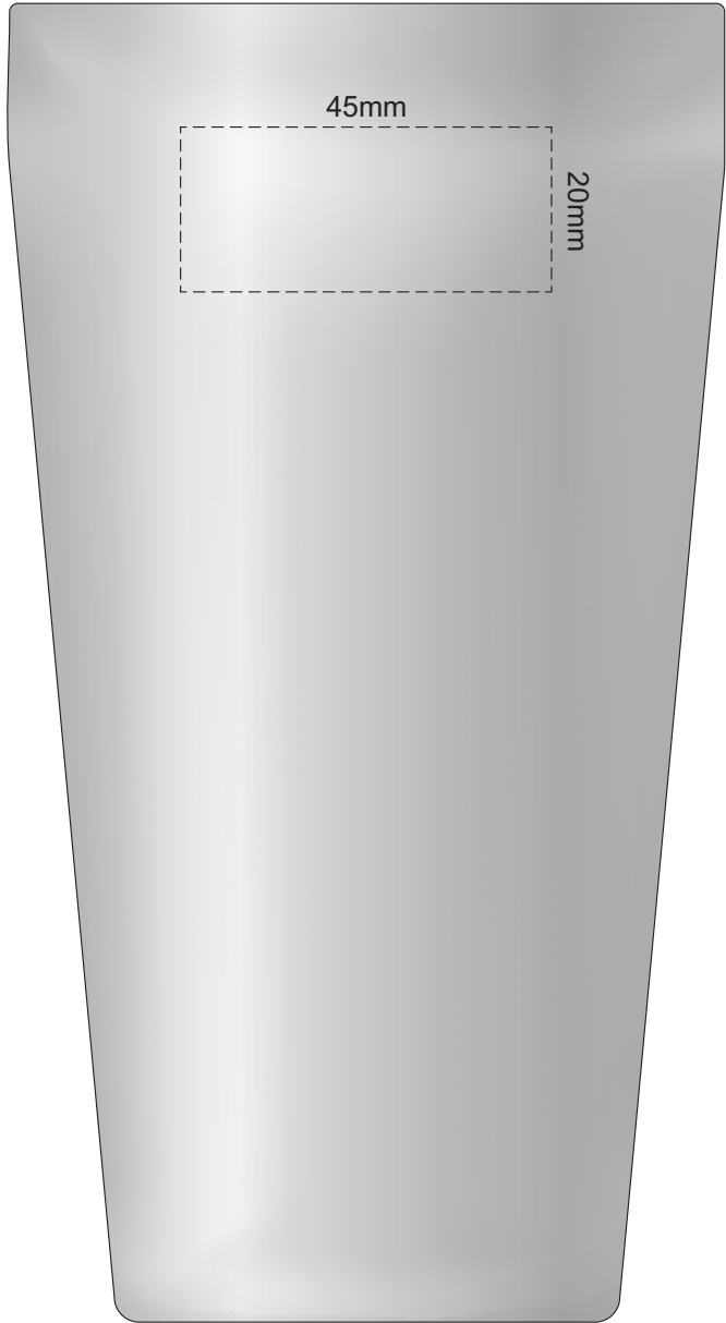
Bottom part of shaker